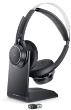
Dell Premier Wireless ANC Headset – WL7022

Elevate your video conferencing experience with the world's best image quality 4K webcam 44 that optimizes your visuals with a large 4K Sony STARVIS™ CMOS sensor and AI Auto-Framing.