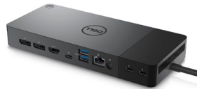
Thunderbolt 4 Dock - WD22TB4

Take your work to new heights with this 23.8-inch FHD monitor featuring brilliant color coverage. Increase your productivity by up to 21% when you use two monitors together 43 .