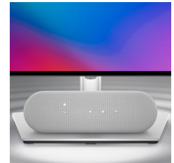
Dell Speakerphone - SP3022

Experience superior multitasking features with a stylish and comfortable premium keyboard and mouse combo. Complete your tasks powered by one of the industry's leading battery lives at up to 36 months 45 .