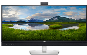
Dell 34 Curved Video Conferencing Monitor - C3422WE

Bring your meetings to life on this 34-inch curved WQHD monitor with an integrated IR camera, dual 5W speakers and a dedicated, one-touch Teams button.