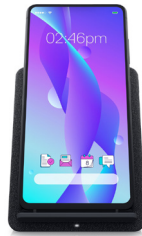
Dell Dual Dock - HD22Q

Bring your meetings to life on this 34-inch curved WQHD monitor with an integrated IR camera, dual 5W speakers and a dedicated, one-touch Teams button.