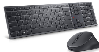
Dell Premier Multi-Device Wireless Keyboard and Mouse - KM7321W

Powerfully productive, this compact dock is the world's first laptop docking station with a wireless charging stand for Qi-enabled smartphone or earbuds 42 . Cellular device not included