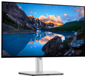
Dell UltraSharp 24 USB-C Hub Monitor – U2422HE (x2)

Take your work to new heights with this 23.8-inch FHD monitor featuring brilliant color coverage. Increase your productivity by up to 21% when you use two monitors together 43 .