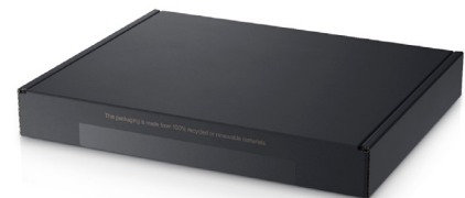
100% recycled or renewable packaging 18

• • • Innovative use of sustainable materials Up to 42% bio-based material in bottom bumpers.