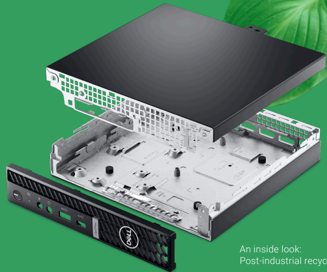
An inside look: Post-industrial recycled steel

OptiPlex is passionate about reducing our products' carbon footprint and helping our customers make an impact on the future. And its why Micro is now the most energy efficient ultracompact commercial PC 1 . We take a circular design approach – innovating with renewable materials, packaging, energy conservation, recycling and even reparability.